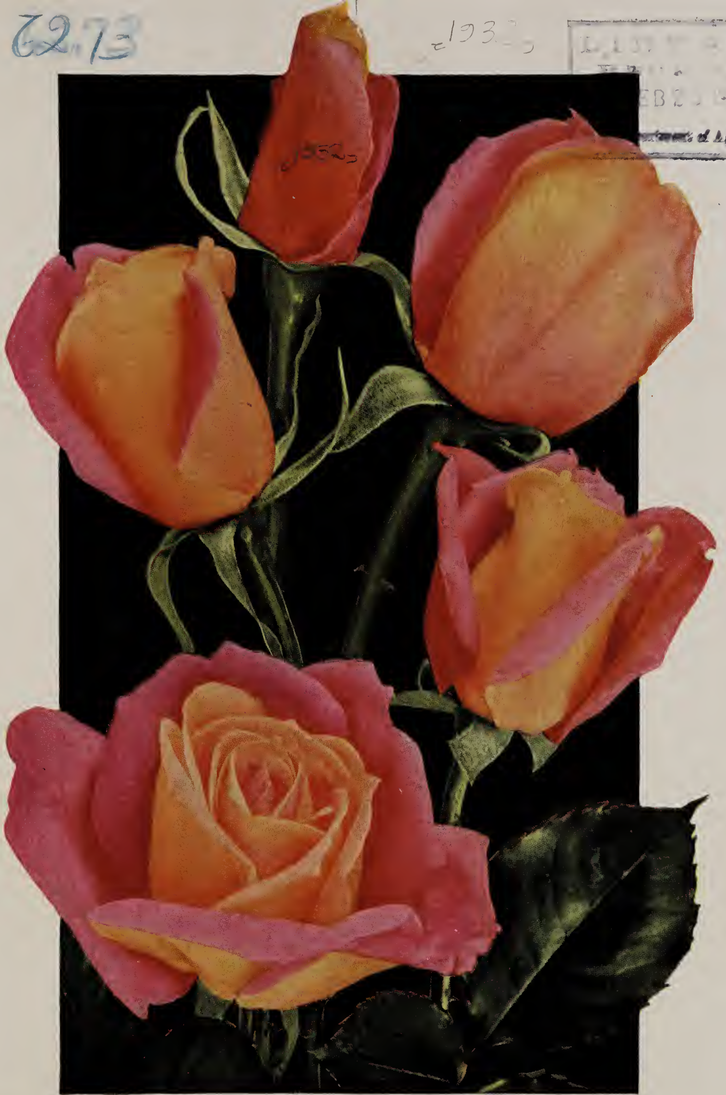
THE PRESIDENT HERBERT HOOVER ROSE. Price $1.25 each

THOMSEN NURSERY COMPANY Artistic Landscape Gardening and Hardy, Choice Nursery Stock (Canoe Camp) MANSFIELD, PENNA.